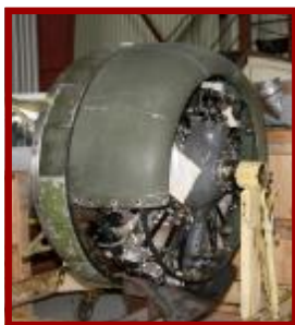
ENGINE LOOKING MORE LIKE AN ENGINE !