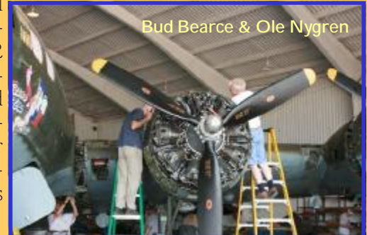
Bud Bearce & Ole Nygren