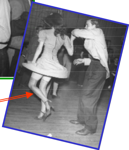
Love the hose

The HOBBY HANGAR HOP is hosted by the 1940 Air Terminal Museum and offers tickets