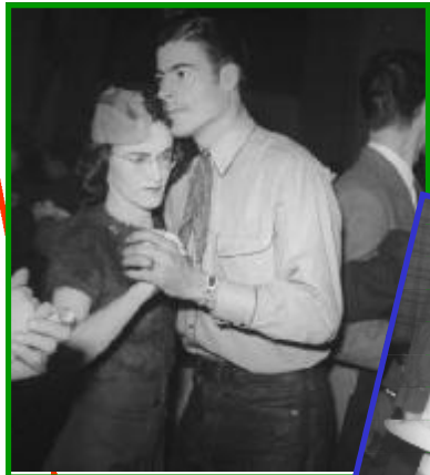
1940's period attire is encouraged.